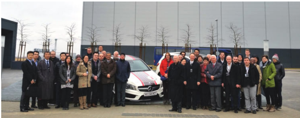
Fig. 4: LoCoMaTech Consortium @ Mercedes-Benz Plant in Kecskemét

An Industrial Advisory Board will overview the work carried out by the partners; members are Mercedes-Benz Manufacturing Hungary and Process&Product .