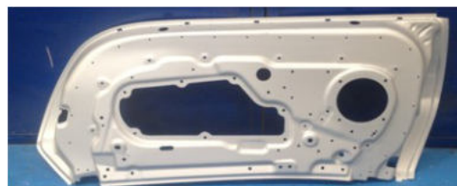
Fig. 1: Door Inner formed at PAB Sept 2015. Most complex HFQ® component

energy efficiency and reduce CO 2 emissions even for lower-cost vehicles. LoCoMaTech can contribute substantially towards helping vehicle manufacturers to meet the increasingly stringent European Union regulations concerning our environment and responsible energy usage .