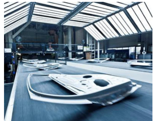
Fig. 3: Serial Press Line

In the LoCoMaTech project, the manufacturing costs will be significantly reduced for the HFQ® process through the introduction of